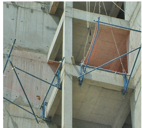
Light duty application available for various beam and slab combination