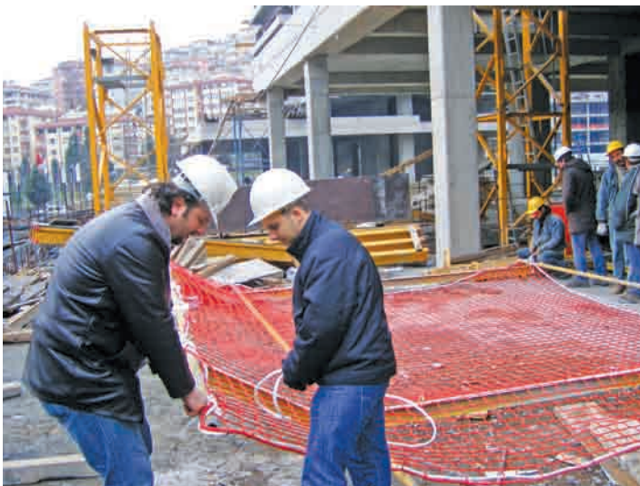
Supervising at job-site