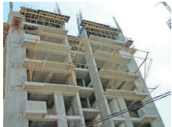
Standard safety Platforms could be ganged and crane handled